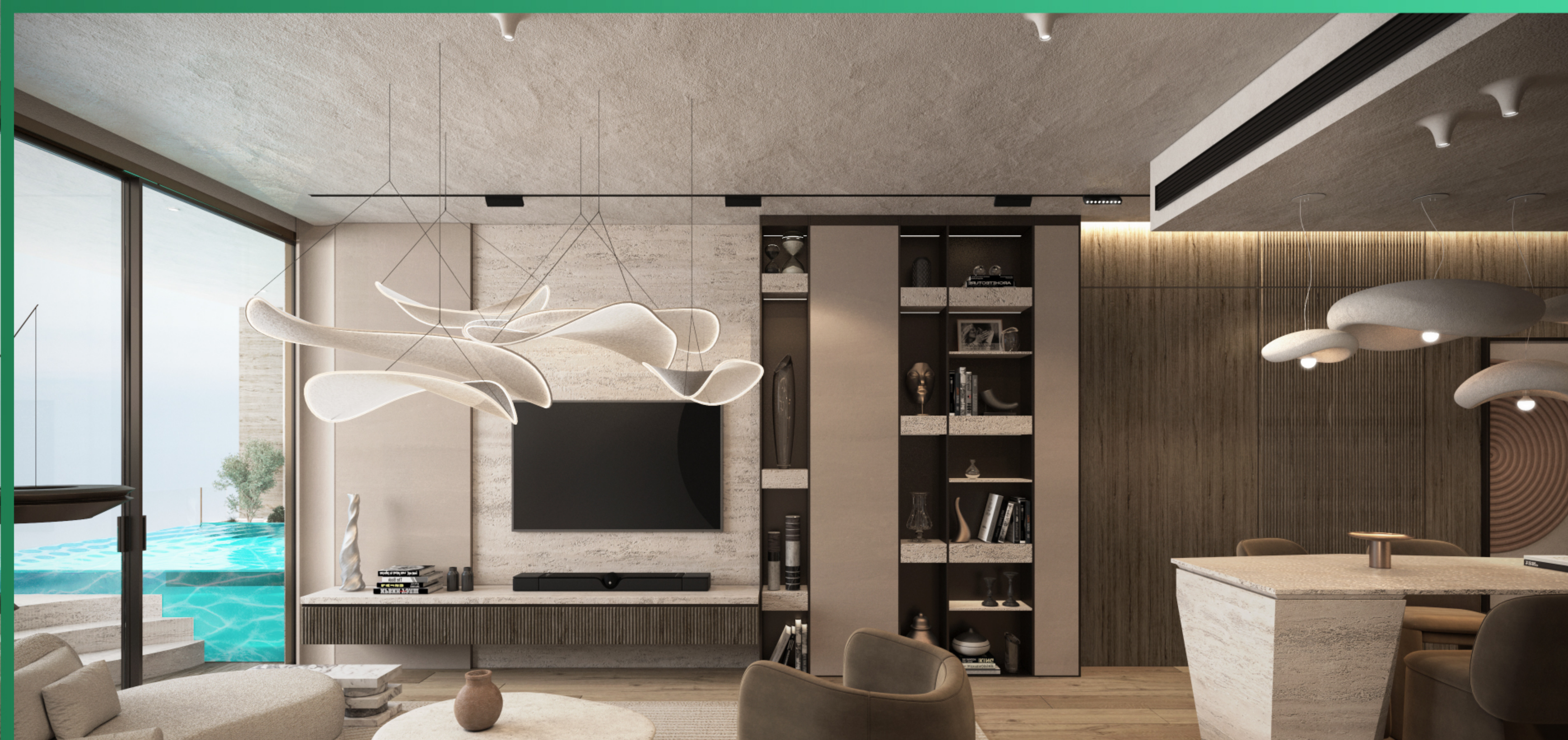
Spacious Living Room Designed For Both Relaxation And Entertainment