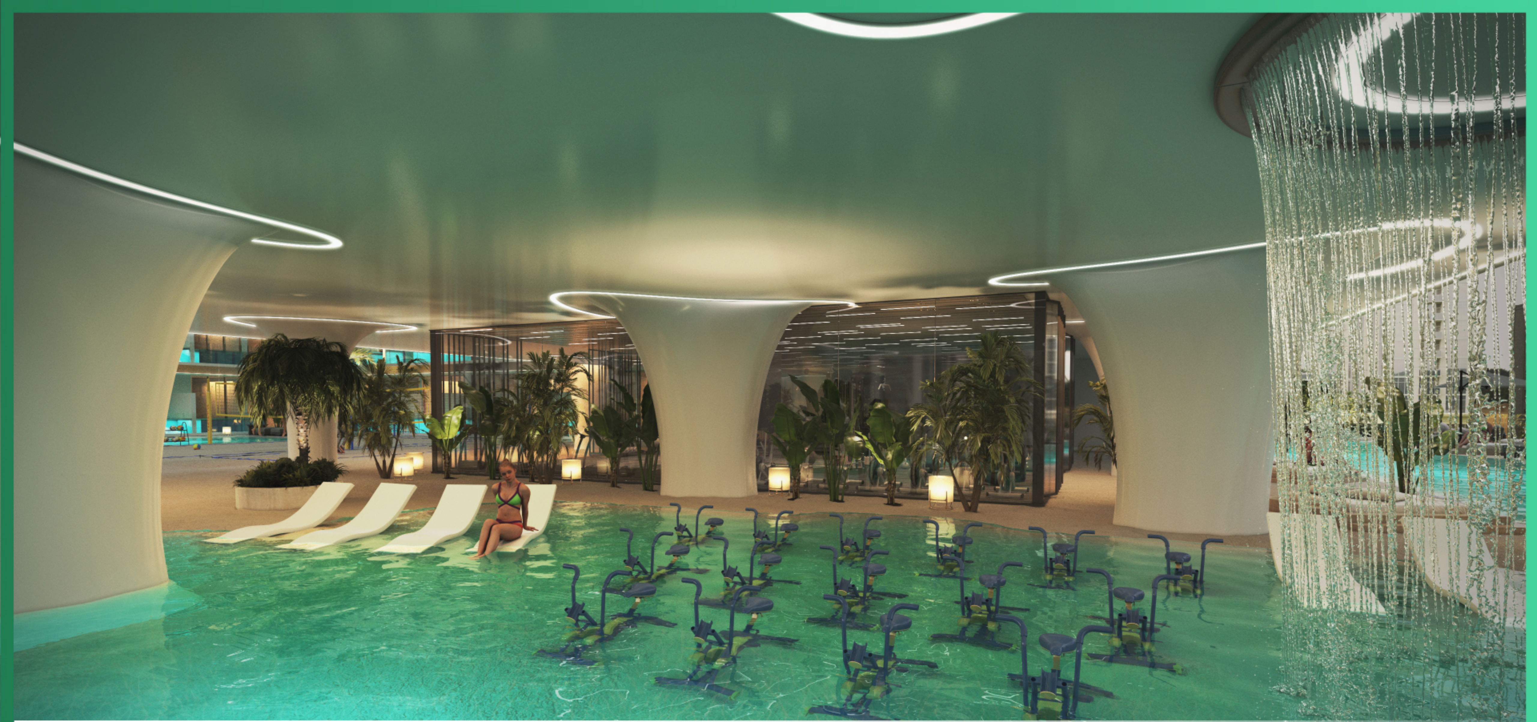
Stay Fit With Our Unique Aqua Gym