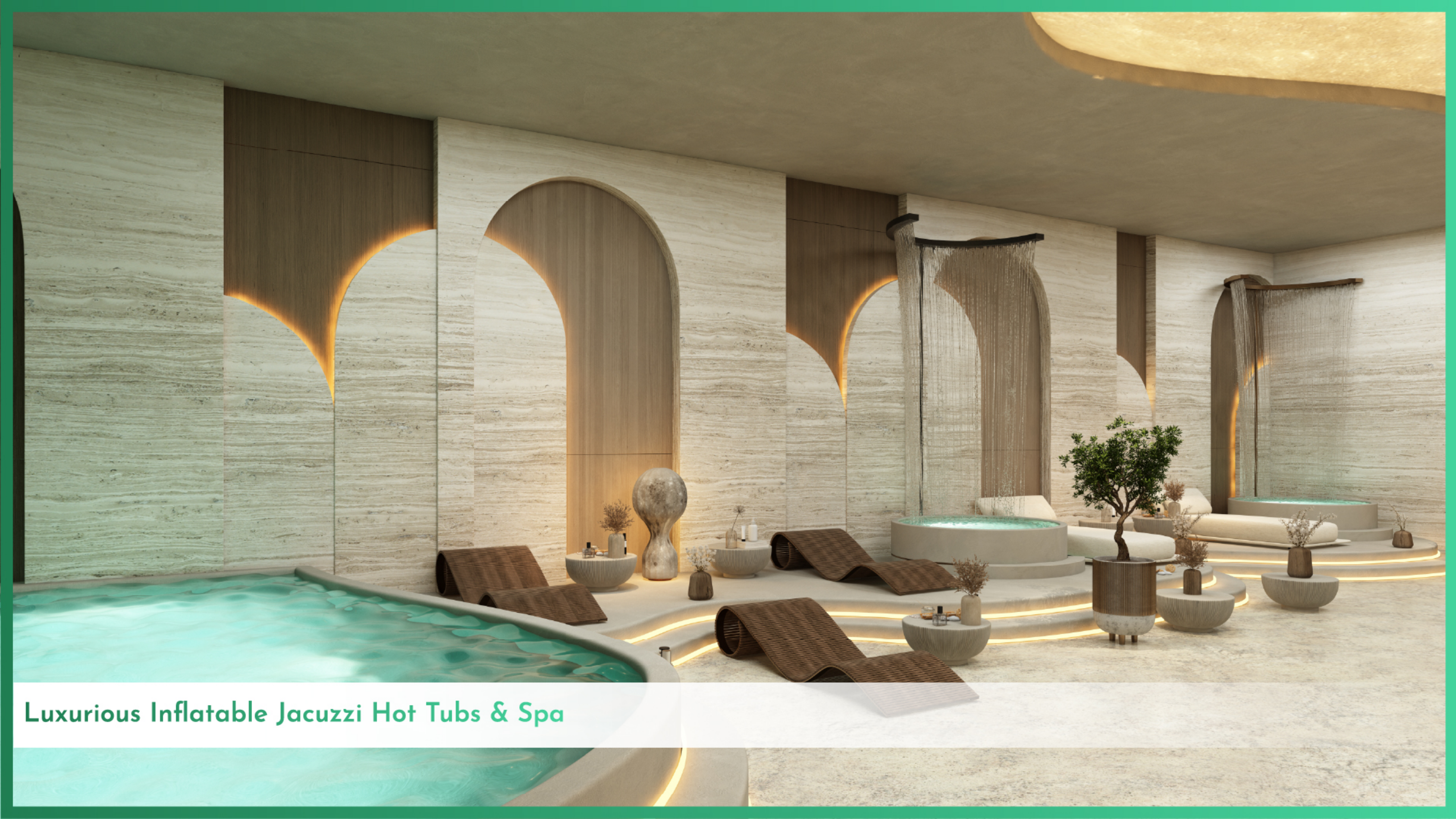
Luxurious Inflatable Jacuzzi Hot Tubs & Spa