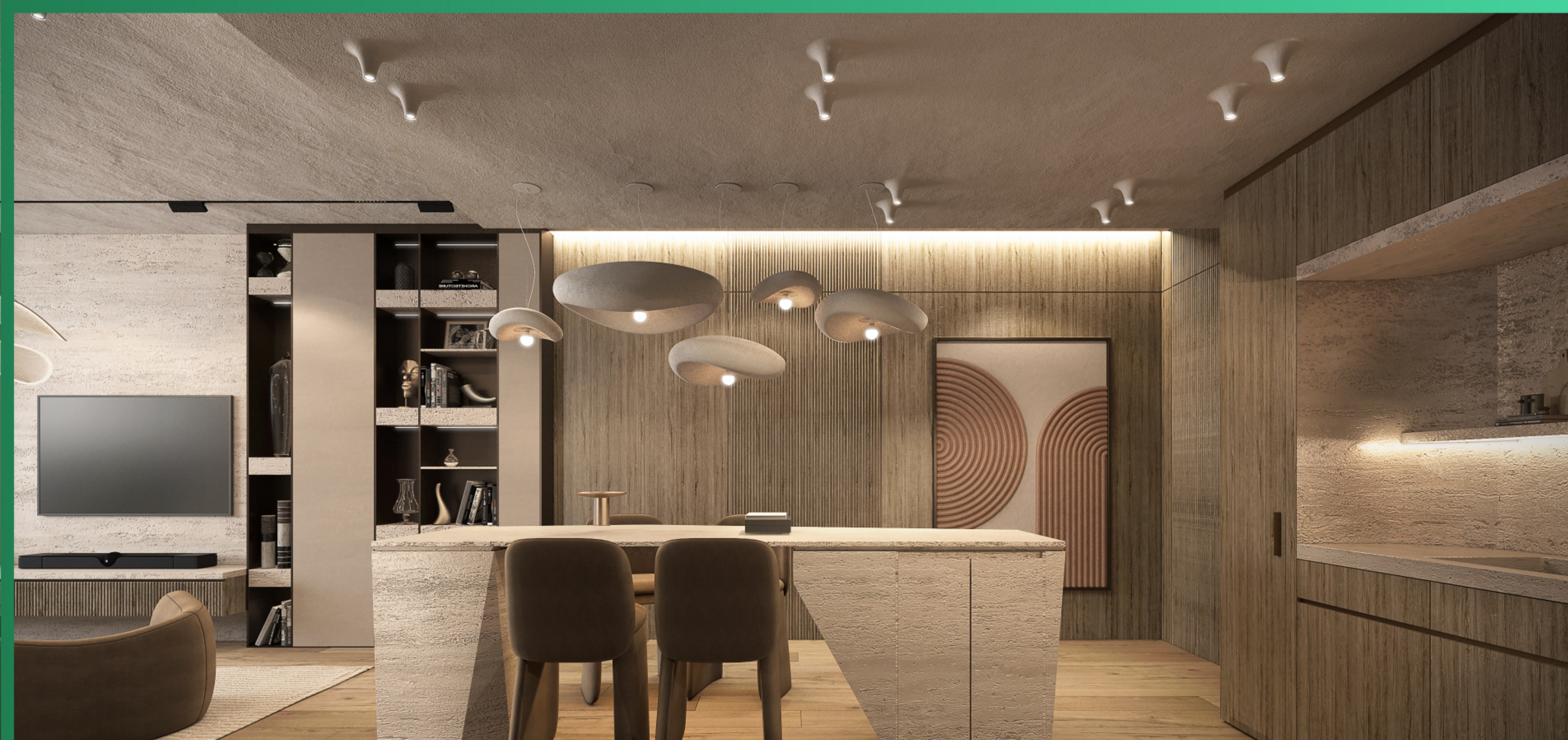
Gourmet Kitchen With High-End Appliances And Spacious Kitchen Island