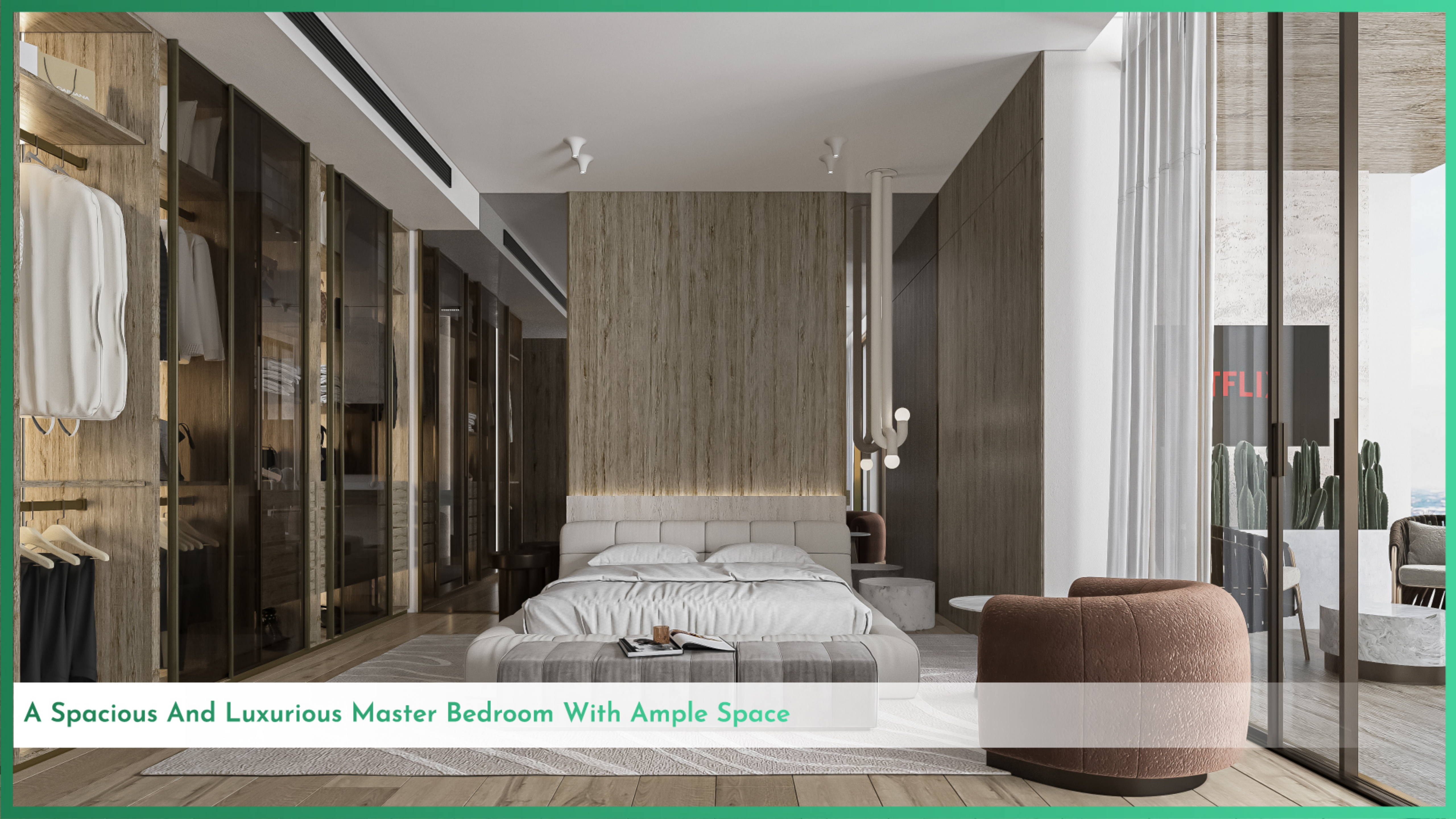
A Spacious And Luxurious Master Bedroom With Ample Space