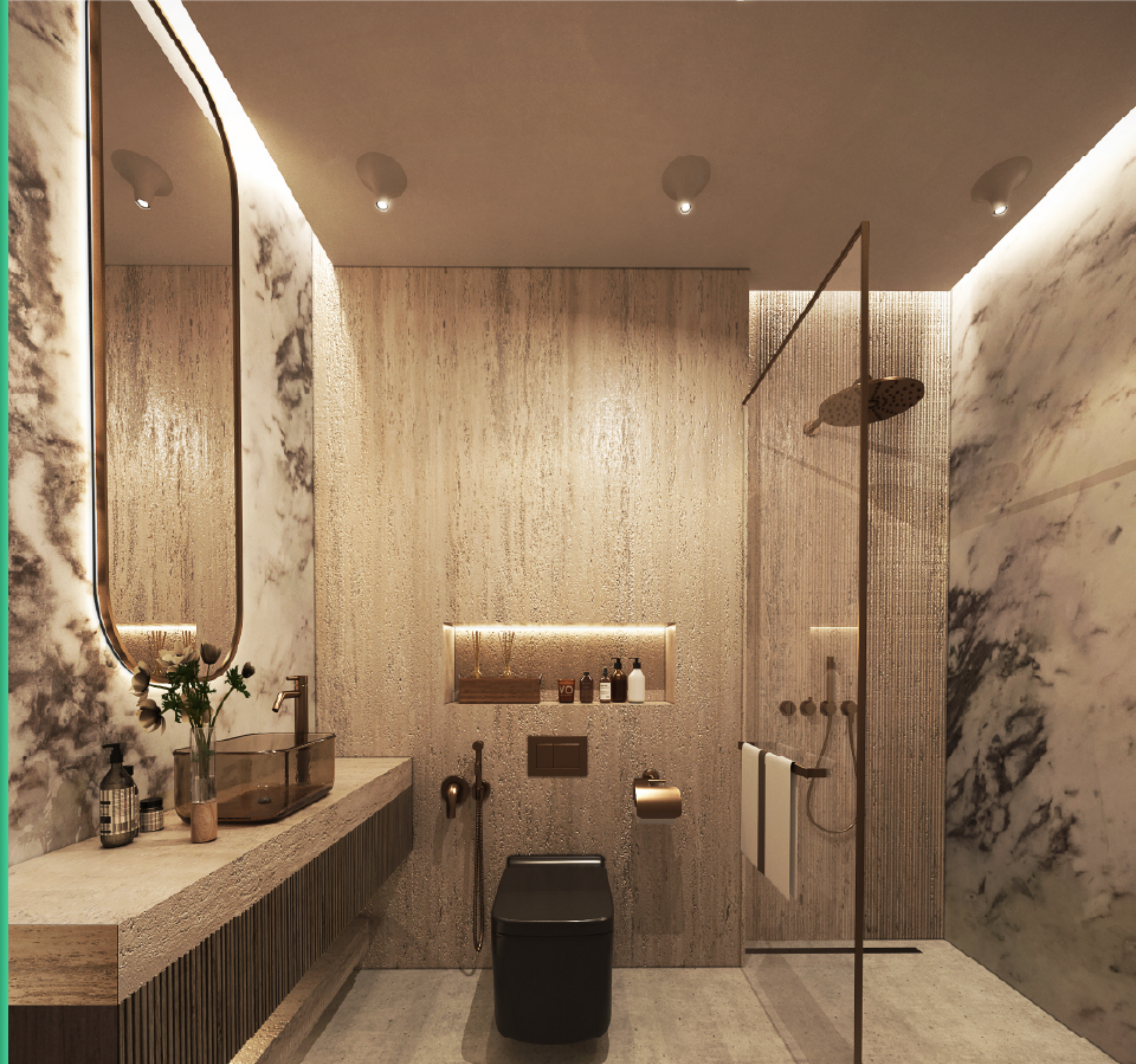
A Stylish Bathroom With Premium Fittings