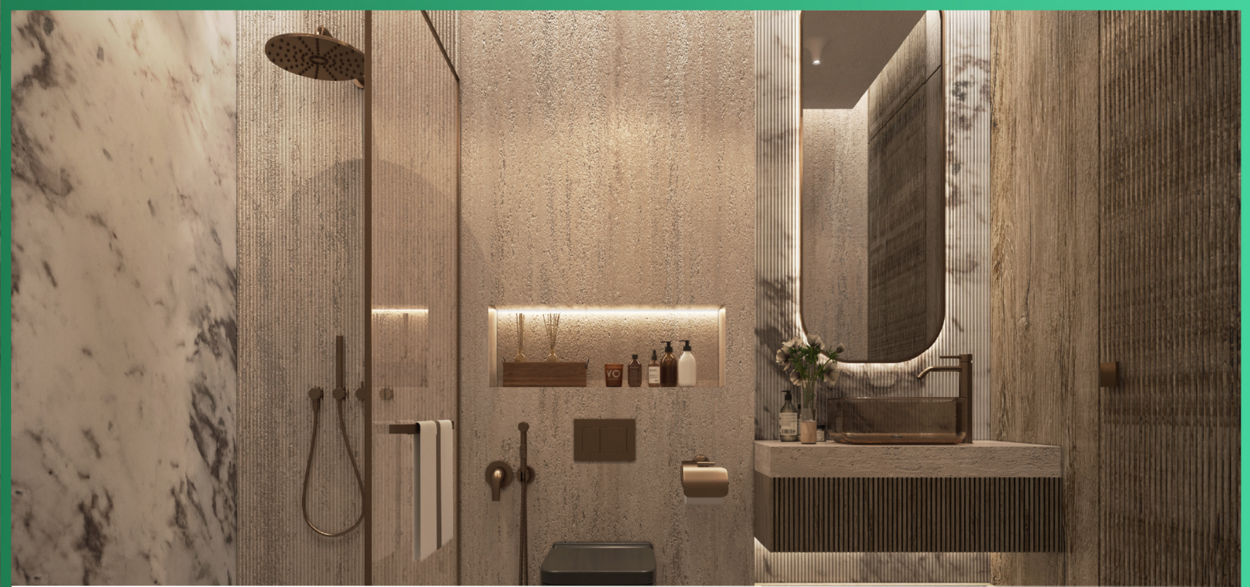
Refined Bathroom Adorned with Contemporary Amenities