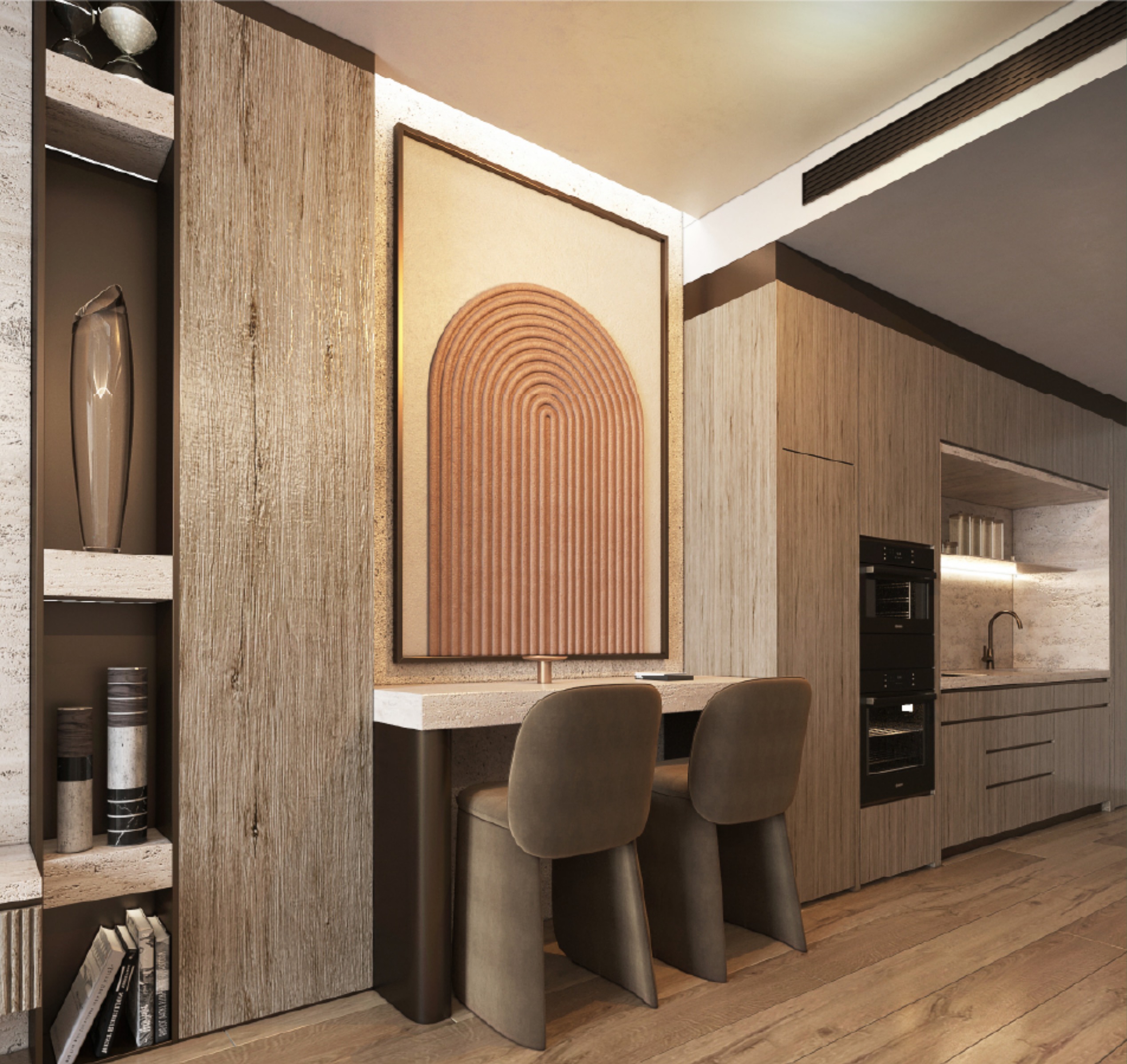
A Compact Study Nook Ideal For Focused Work