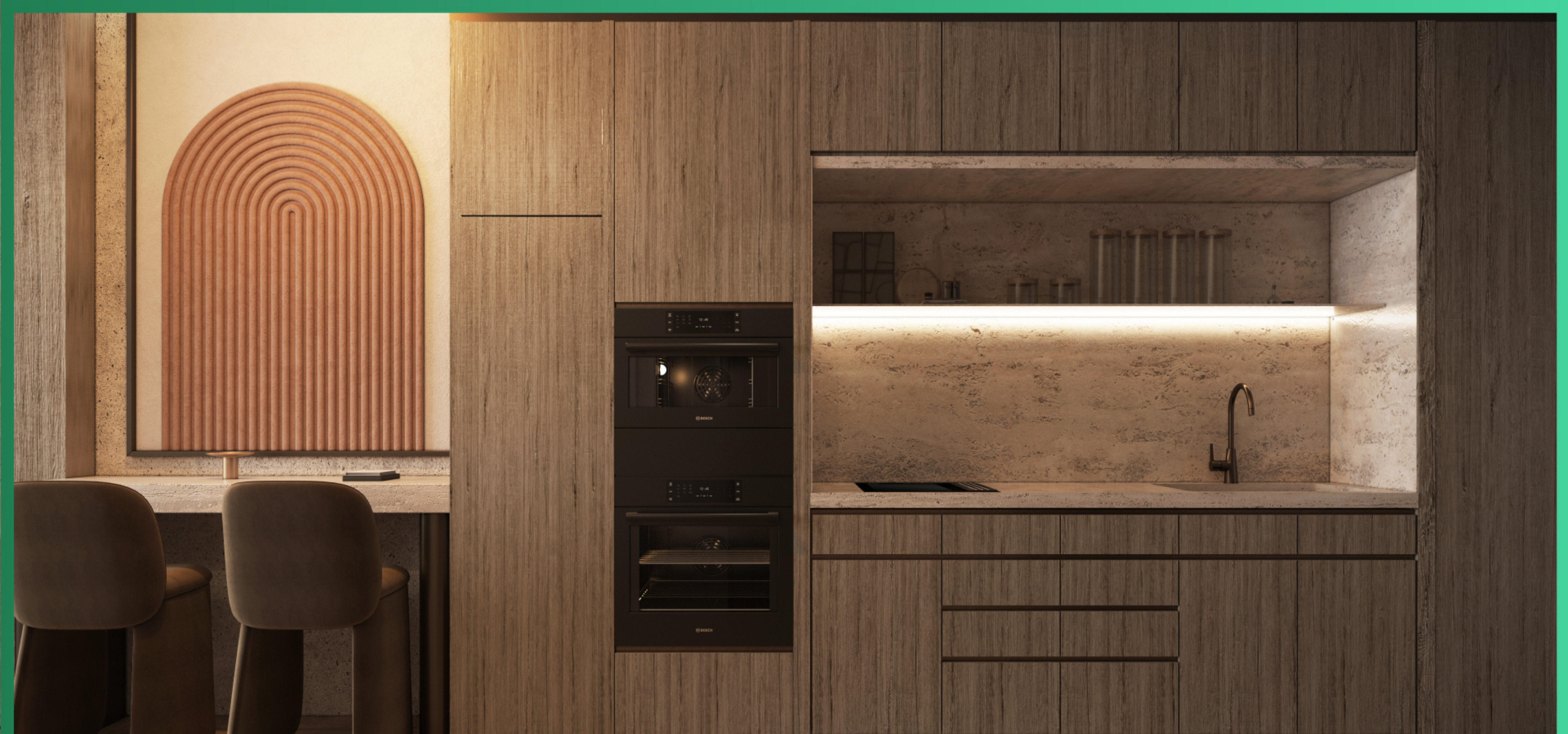
A Modern, Fully-Equipped Kitchen