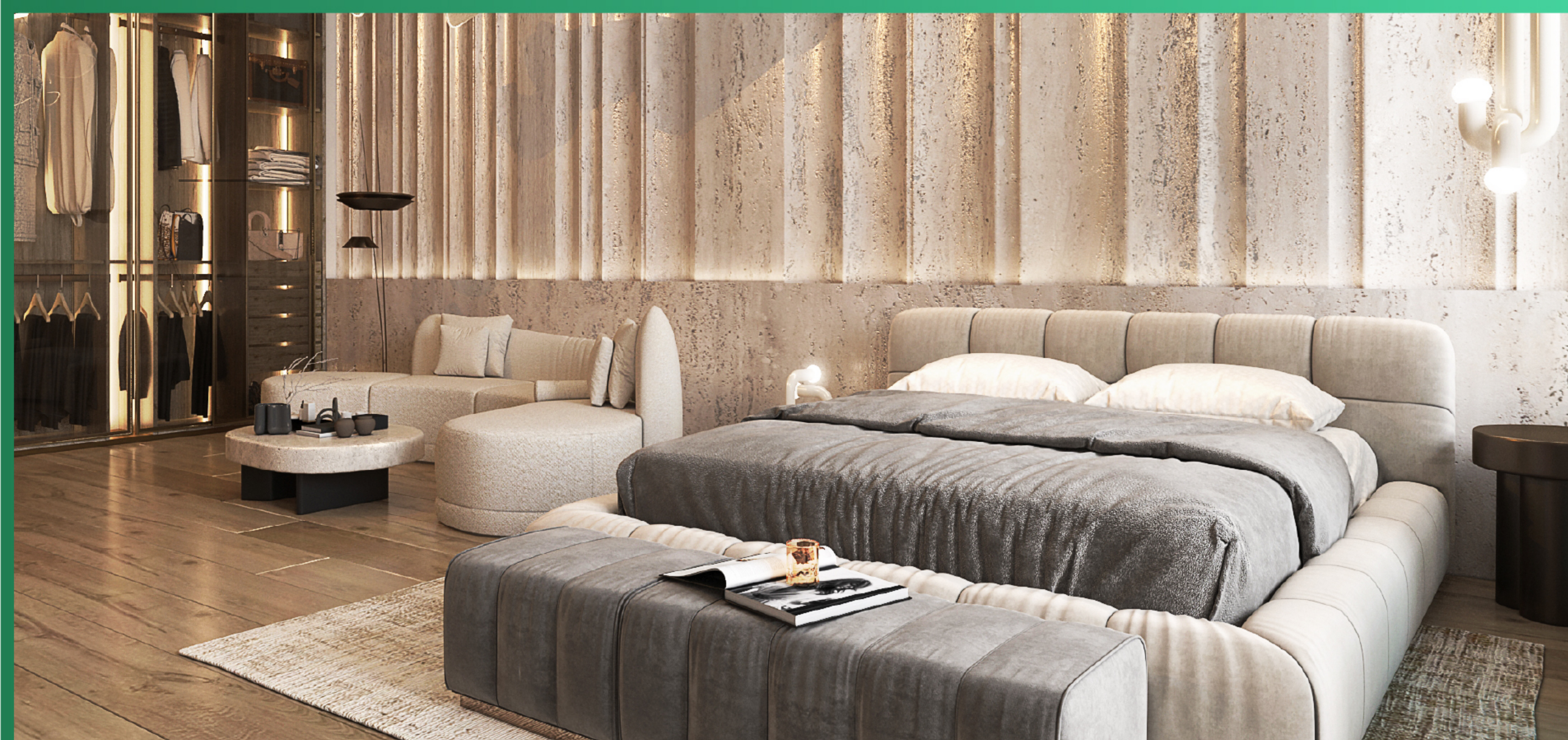
A Serene Bedroom