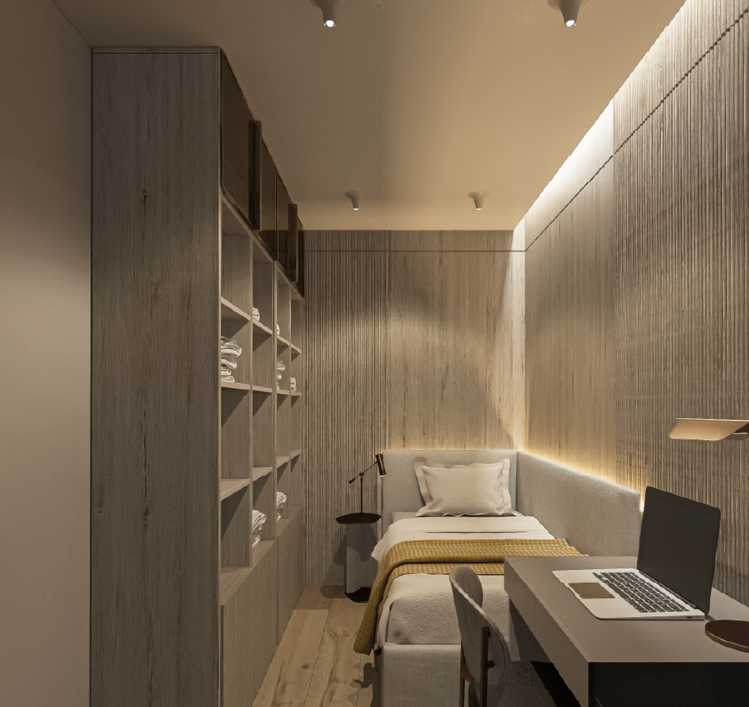
A Quiet Retreat With A Dedicated Workspace