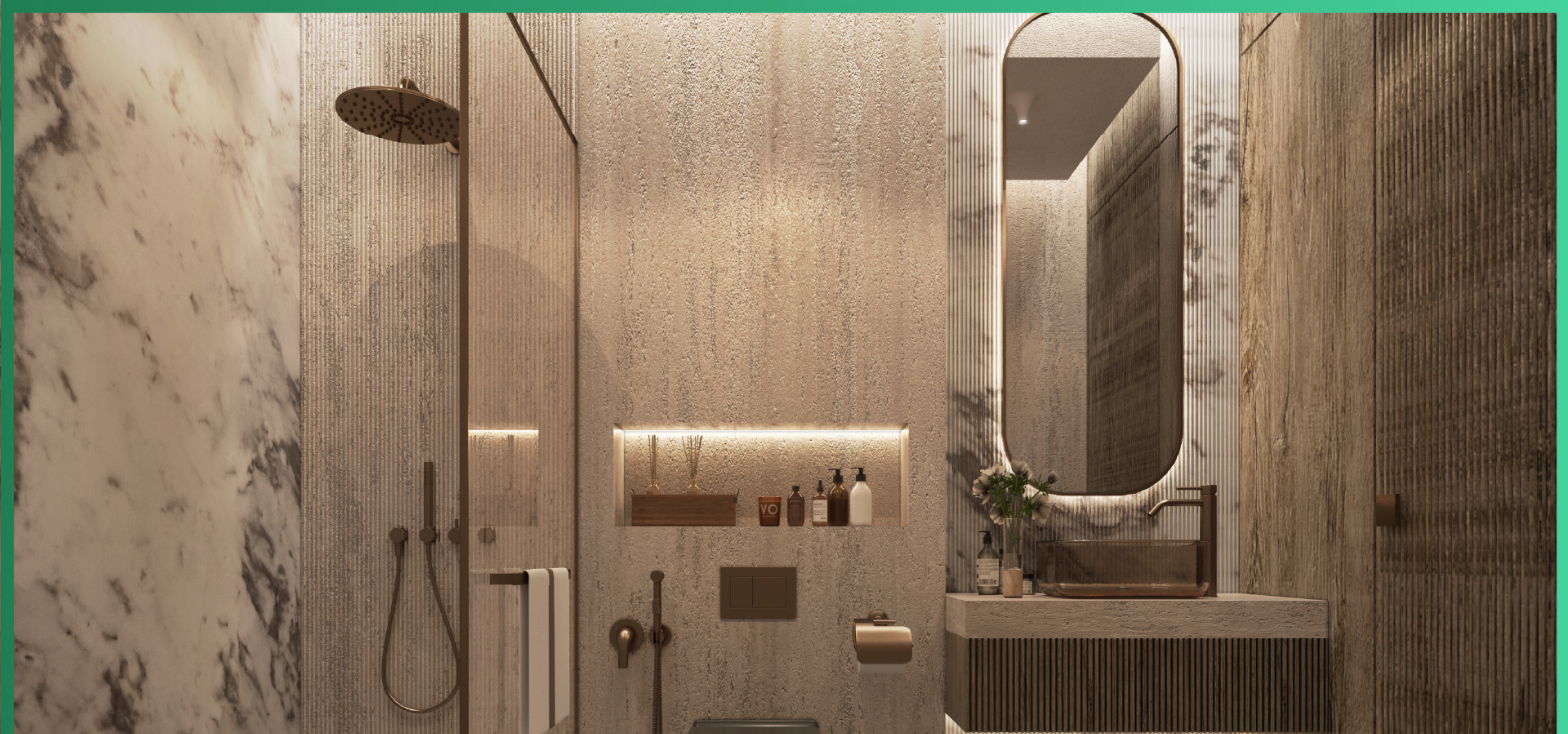
Elegant Bathroom With Modern Amenities